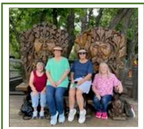
TULSA BOTANICAL GARDEN TOUR Pictured: Members and guest of Jenks OHCE enjoying their recent field trip to the Tulsa Botanical Gardens.